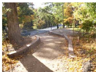
Trail constructed to save trees