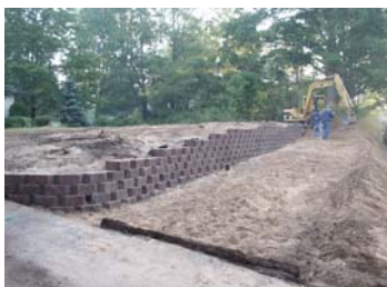
Retaining wall under construction

This four-mile long trail begins in the central business district of the Township and passes through residential areas, farmlands, wetlands, wooded areas, and eventually connects with another extensive trail network in Cascade Township. The project required right-of-way and easement acquisition from numerous property owners including the Amway Corporation, Consumers Energy, churches, schools, and residents. Funding for the project was provided through a combination of individual donations, township funds, and Enhancement Grant funds secured from MDOT. Design challenges included boardwalks through several wetlands areas and retaining walls constructed to save trees and minimize earthwork.