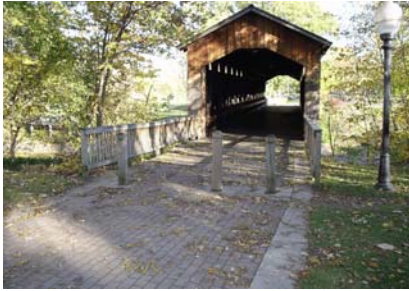
Ada Covered Bridge