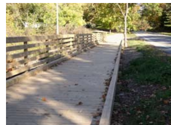
Boardwalk over wetlands